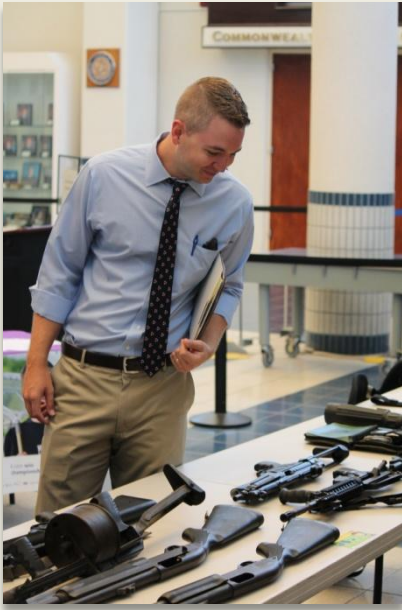
Staff of the Office of Adult Probation with their 14th Annual Pretrial, Probation, and Parole Supervision Week exhibits